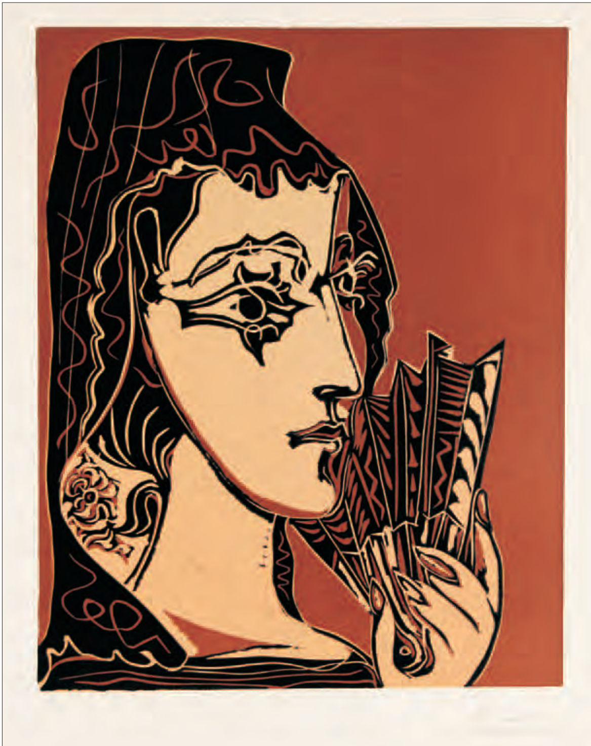
L'Espagnole , 1962

his heritage. Works such as L'Espagnole show the beauty of the traditional Spanish costume in a radically modern style. Other works such as La Grande Corrida and Le Picador II capture the grand drama of the Spanish bull fight.