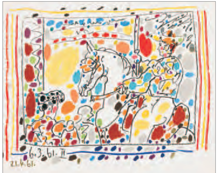
Le Picador II, 1961

Lithograph on Arches paper. A rare proof apart from the signed and numbered edition of 50, with full margins. Provenance: From Picasso's Personal Collection to Mourlot Collection; a rare working proof from the edition of 5+; 1 kept for the Mourlot Collection. Bloch 598, Mourlot 168. #905806. 21 5/8 x 26 3/8 inches