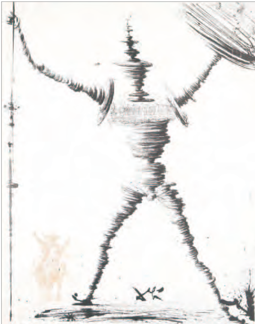
Don Quixote , 1957 #908504

Color Lithographs From Dali's Don Quixote de la Manche portfolio. A collaborator's copy, aside from the edition of 118 numbered copies on vélin de Rives, of a total edition of 233. With the printed text "Exemplaire Imprimé Spécialement pour Monsieru Armand Petitjean," verso of the justification page. Published by Joseph Foret, Paris. Michler/Löpsinger 1001-12; Field 57-1. Each page, 25 ½ x 16 inches.