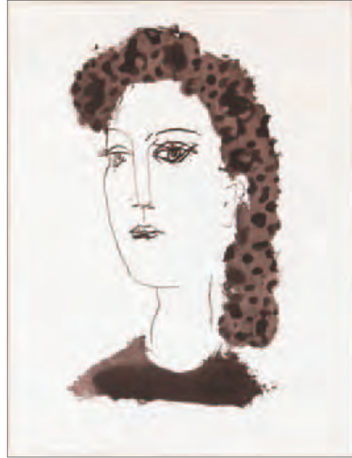
Gongora - Illustration. Femme Brune de Trois Quarts, 1947

Left- Original copper plate made by the artist to illustrate the book "Vingt Poems de Gongora." This copper plate is the one used to print the page "Illustration. Femme Brune de Trois Quarts," with the date 27 fevrier 47 XII Gongora. The copper plate was cancelled by Jacques Frelaut on April 15, 1983. Bloch 511; Baer 773; Cramer no 51/36. #904279 16 1/8 x 12 1/8 inches