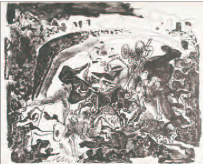
La Grande Corrida, 1949

Right- Original aquatint on Marais paper with the Gongora watermark designed by the artist. From the edition of 250. Book edition "209/250." Bloch 511; Baer 773; Cramer no 51/36. #904280. 15 x 11 inches