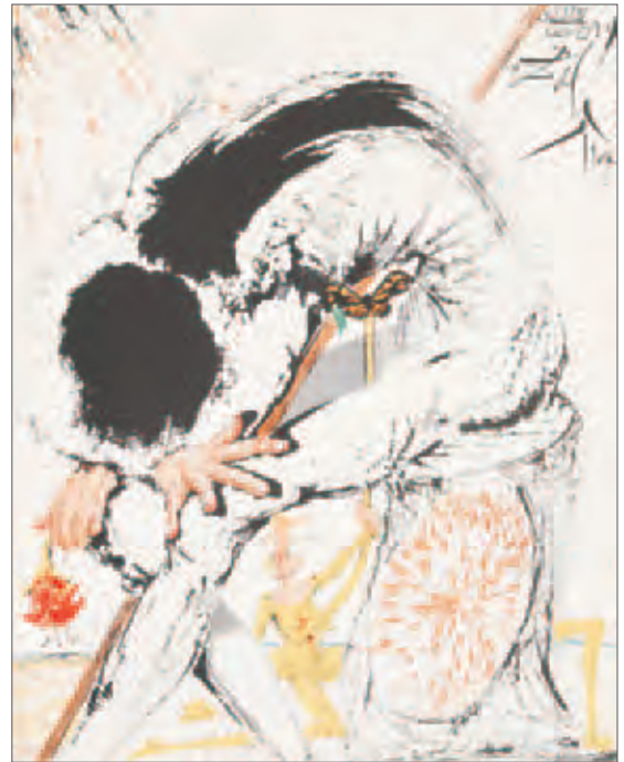
Don Quichotte Overwhelmed , 1957 #908506.

D on Quixote is arguably one of the most important and most widely read works of Western literature. Written during Spain's Golden Age, Don Quixote was instrumental in the formation of the Spanish language as we know it today. The tale is of Alonso Quixano, a man so enraptured in tales of chivalry and heroes of the past that he appears to have gone mad, living in a world of fantasy and delusion. Likely one of the most iconic images of the epic is that of the Great Don Quixote tilting the windmills of La Mancha, imagining himself a knight fending off a dragon. Dali illustrates the tale in an explosion of color and imagery that rivals the insanity of the legend's protagonist.