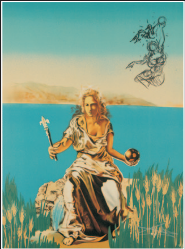
The Coronation of Gala (The Empress), 1976 Color lithograph on Arches. Signed lower right in white crayon, numbered 60/150 lower left in white crayon. From the Visions Surréaliste series. 29 7/8 x 21 1/2" Field 76-4A, Prestel 1488. #910314