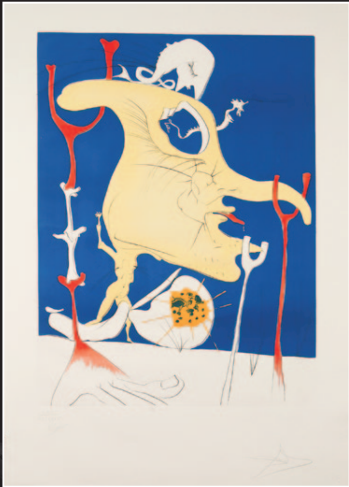
Le Dernier venu de la dernière planète (Latecomer from the last planet) , 1974/1976 Drypoint etching on chromolithographs on BFK Rives Signed lower right in pencil, numbered lower left CLVI/ CLXXXXV and signed again From the series "La Conquête du Cosmos" series; signed and authenticated by Frank Hunter in pencil and stamped verso, dated 18 September 2009 39 x 27 3 / 8 " Field 74-12G, Prestel 641 #910293