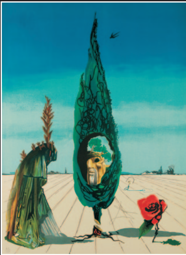
Enigma of the Rose (Death), 1976 Color lithograph on Arches. Signed lower right in pencil, numbered 60/150 lower left in pencil; From the Visions Surréaliste series. 29 7/8 x 21 1/2". (Also shown on front cover) Field 76-4D, Prestel 1490. #910315