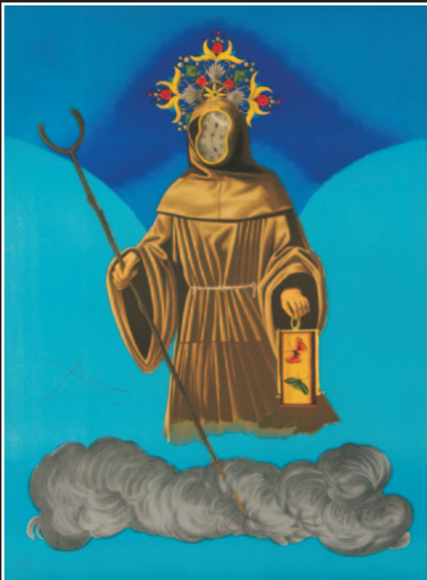
Mystery of Sleep (The Hermit), 1976 Color lithograph on Arches. Signed lower-center left in pencil, numbered 60/150 lower left in pencil. From the Visions Surréaliste series. 29 7/8 x 21 1/2" Field 76-4C, Prestel 1487. #910316