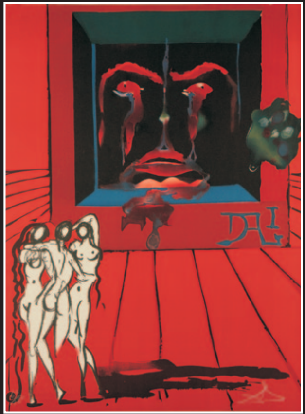
Obsession of the Heart (The World), 1976 Color lithograph on Arches. Signed lower right in white crayon, numbered 60/150 lower left in white crayon. From the Visions Surréaliste series. 29 7/8 x 21 1/2" Field 76-4B, Prestel 1489. #910317