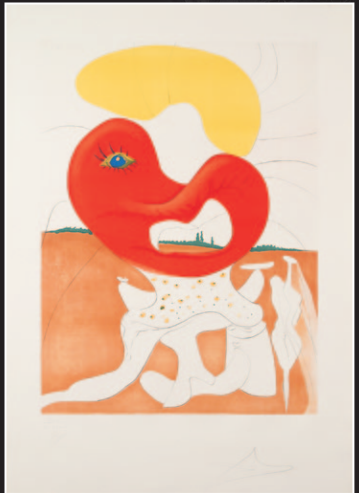
Le Sang du yin et du yang (The Blood of Yin and Yang) , 1974/1976 Drypoint etching on chromolithographs on BFK Rives Signed lower right in pencil, numbered lower left CLVI/ CLXXXXV and signed again From the series "La Conquête du Cosmos" series; signed and authenticated by Frank Hunter in pencil and stamped verso, dated 18 September 2009 39 x 27 3 / 8 " Field 74-12L, Prestel 652 #910294